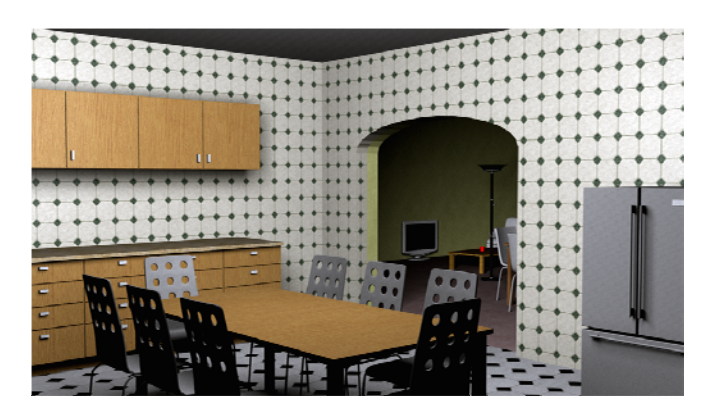
Fig. 2 The placement of the furniture in these rooms was handled by our layout solving approach based on the geometric relationships between the different feature classes defined in the semantic library.

One of the innovative declarative input methods introduced by SketchaWorld is designated as procedural sketching [7], a novel paradigm which significantly increases the usability of procedural modeling techniques, and provides a fast and intuitive way to model virtual worlds. Procedural sketching allows designers to quickly specify terrain features and directly see the effects of the resulting procedural modeling operations. It lets designers interactively sketch their virtual world in terms of high-level terrain features; for instance, one can coarsely sketch out an area for a city or forest. These sketched features are then procedurally expanded by a variety of integrated procedural methods and properly fit into the virtual world, adhering to the feature's semantics and relationships with surrounding features. Design of a virtual world is a creative and iterative process, therefore procedural sketching provides a short feedback loop between each sketch operation and the visualization of generated results. This, combined with unlimited undo and redo facilities, strongly