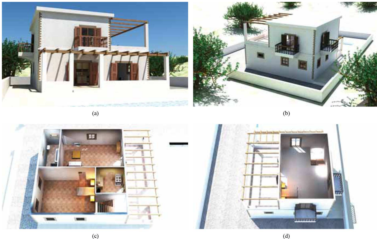
Fig. 4. Example of a Greek holiday two-story luxurious villa: (a) front view with veranda and pool; (b) back view with different types of windows depending on adjacent rooms; (c) second floor with balconies, terrace, and staircase; (d) first floor with several rooms.

the building model from reaching an irreversible invalid state, where required building elements are misplaced or excluded. For instance, a façade generator can use the selection and marking mechanism to prevent the exclusion of an (initially misplaced) front door.