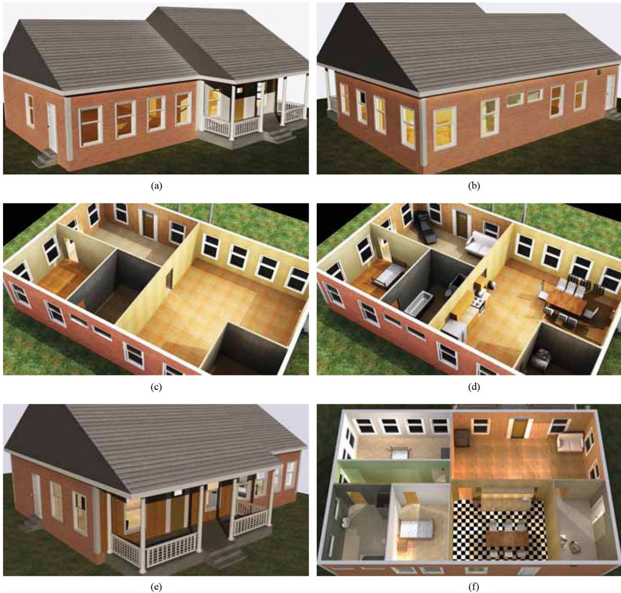
Fig. 3. Generation of a North American villa: (a) front view with porch; (b) back view with different types of windows and side doors depending on adjacent rooms; (c) top view on the different rooms (great room, kitchen, bathroom, bedroom, laundry room); (d) automatically placed furniture based on room types and object relations; (e)–(f) front view and interior view of the same plan, but now using another floor plan generation technique, that of Marson and Musse [28].

in the shape grammar to achieve the uniform façade patterns typically found in motels. However, inquiries are used to determine whether a window is allowed at a certain position and whether it should be a normal or a small bathroom window.