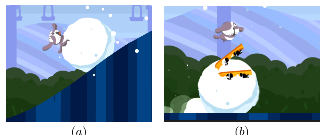
Figure 1: In ( a ), player looses its balance on the rolling snowball, due to steep slope. Later on, slope difficulty has decreased, and player jumps over an obstacle the snowball picks up ( b )

Rafael Bidarra Delft University of Technology The Netherlands r.bidarra@tudelft.nl